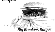
Big Breakers Burger